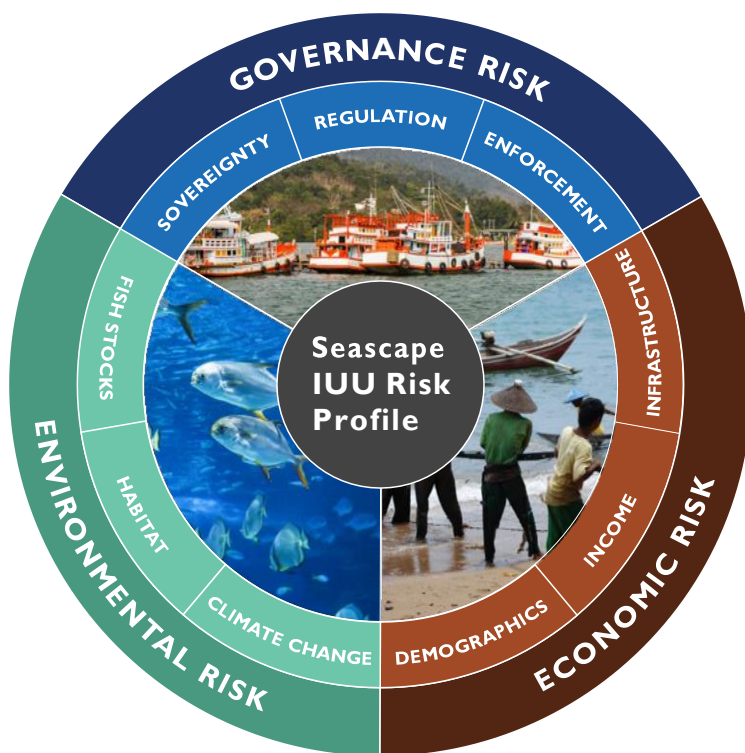
Figure 32: Seascape IUU Risk Profile