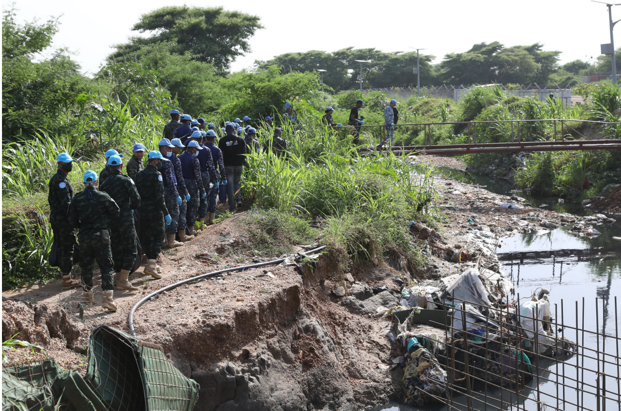
UNMISS visit to communities in Upper Nile affected by floods and clashes.