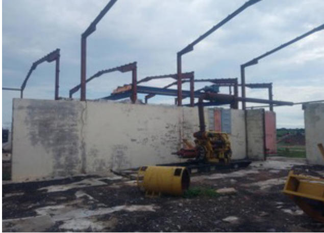
Bentiu power station, destroyed in the civil war. Thudan Gai Majiok

no electricity for other local government offices. The military bases do not have electricity. A small minority of households, considered to be relatively affluent, have purchased small solar panels for their homes. In the vast IDP camp, diesel generators are operated in the markets by local traders and supply shops, businesses, and phone-charging kiosks. UNMISS has installed some solar lights in communal facilities, though these are vulnerable to looting. Otherwise, people rely on flashlights and their phones for light.