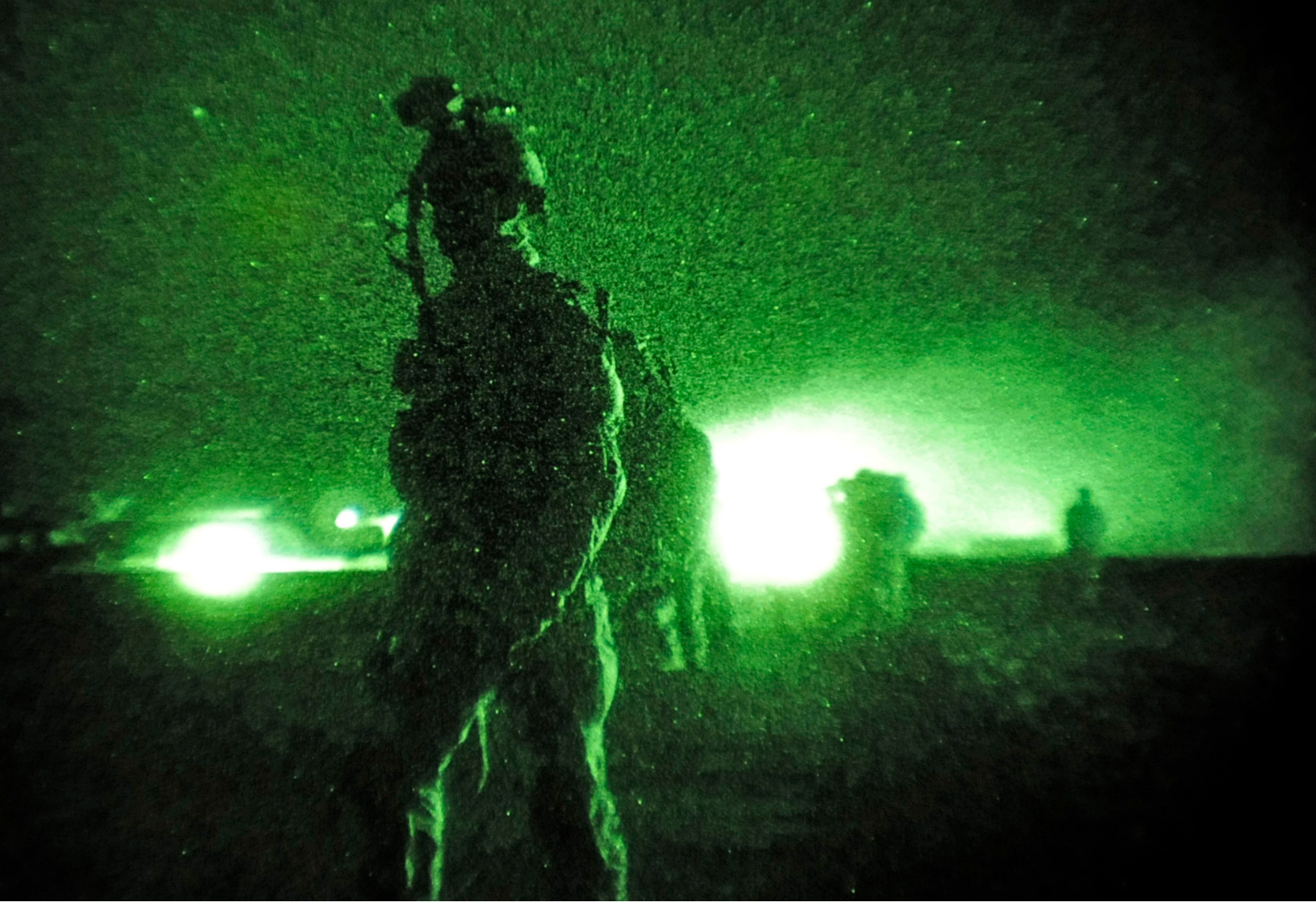
Special Operations Task Group prepare for a helicopter insertion

between the Air Force and CIA over the drone program. Beyond the implausibility of accountability for covert action, the statutory authority by which a strike is conducted, and the agency that oversees it, also impair consistent congressional oversight. Covert CIA strikes conducted under Title 50 are subject to the rigid requirements of the covert action statute, but oversight is limited to only a handful of congressional leaders. Meanwhile, military strikes are subject to a more arcane system of congressional reporting (e.g. for sensitive and non-sensitive military operations), but more clearly subject to provisions requiring public estimates of civilian casualties (under § 1057 of the 2018 NDAA, as amended) and more plainly subject to requirements under the War Powers Resolution.