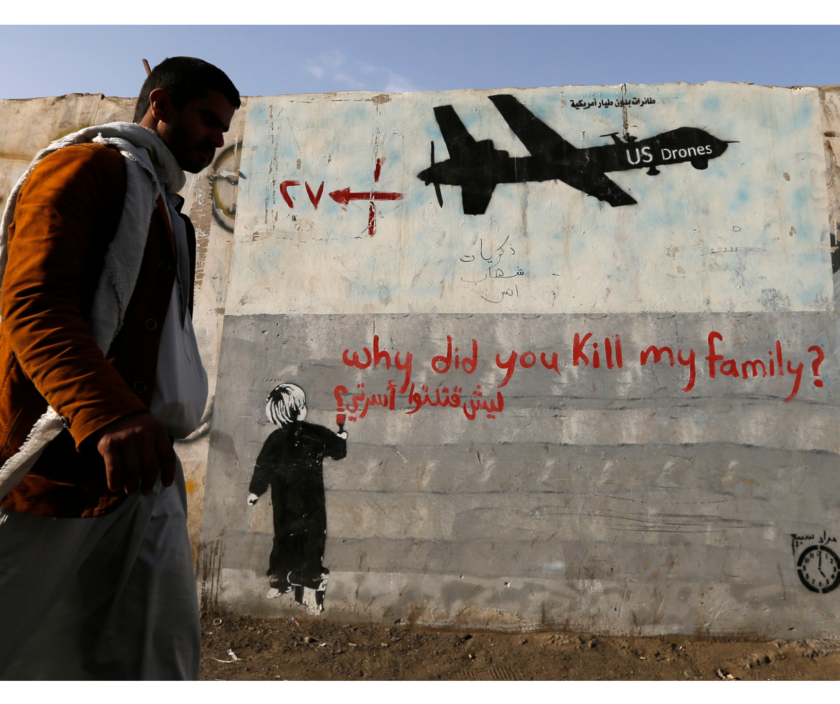
A man walks past a graffiti, denouncing strikes by U.S. drones in Yemen, painted on a wall in Sanaa November 13, 2014.