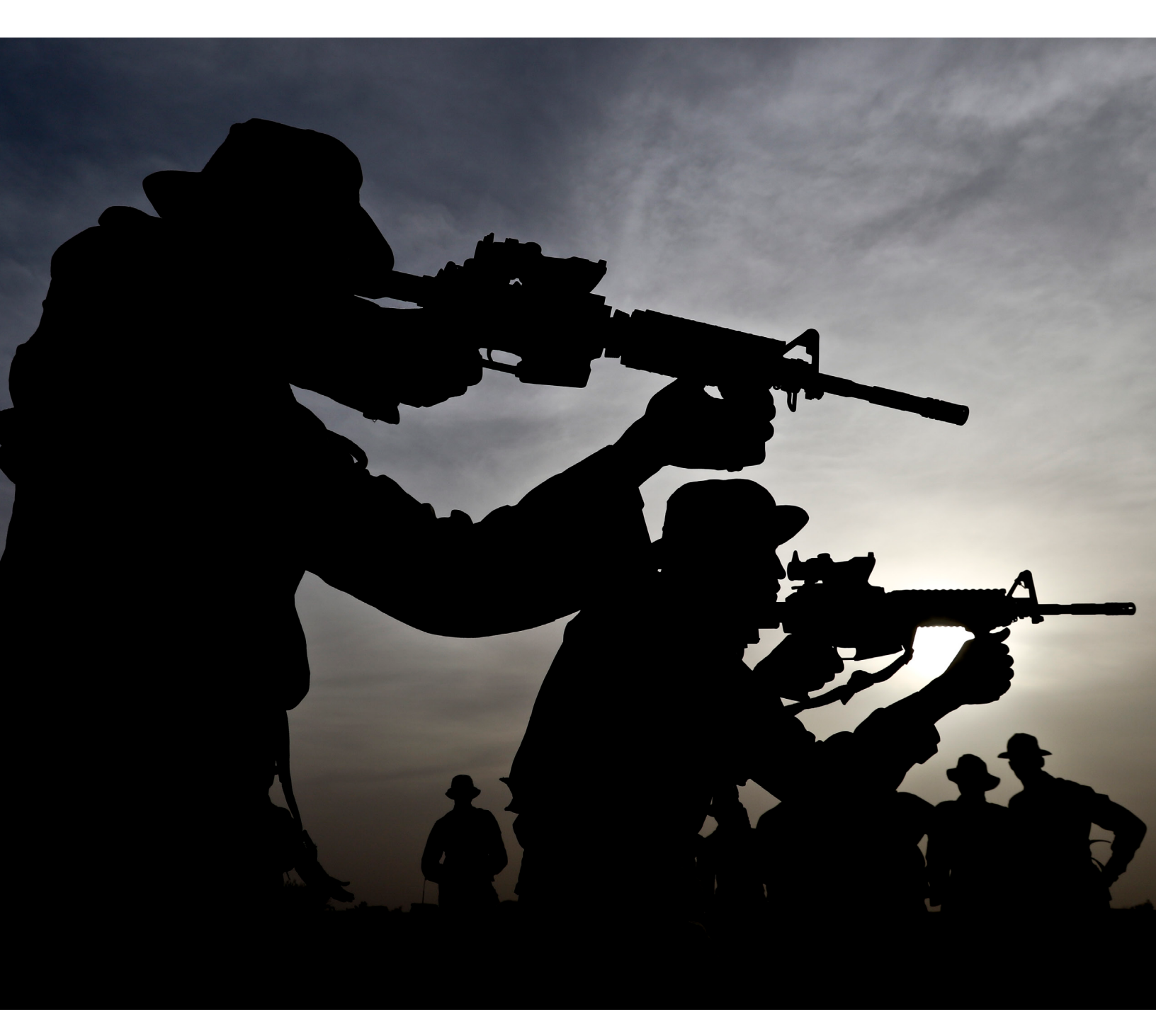
Flintlock 2018 training in Tahoua, Niger