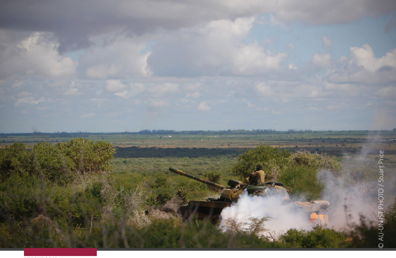
AFGOYE 2012 A tank prepares to cross bushland outside of Mogadishu, Somalia.

the transfer of conventional arms" covered by the Treaty. These measures require the establishment and maintenance of fully functioning national control systems among States Parties, as outlined in article 5 of the Treaty.