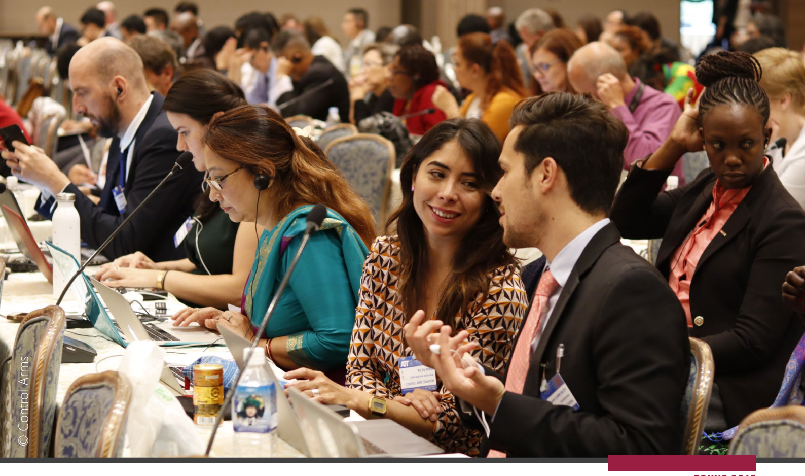
TOKYO 2018 Participants at the 4<sup>th</sup> Conference of States Parties of the ATT,

activities and identities. This creates fertile ground for the illegal trade and diversion of arms. Most ATT States Parties are also party to the Convention against Corruption, 99 and as such are already obligated to undertake anti-corruption measures and are required to establish corruption and bribery as criminal offences in national law. A range of measures are set out in the Convention, as well as in other multilateral and regional instruments to prevent corruption. 100 Article 6(2) requires States Parties to apply these anti-corruption obligations to transfers of conventional arms and related items and strengthens article 15(6) of the ATT, which reads: "States Parties are encouraged to take national measures and to cooperate with each other to prevent the transfer of conventional arms covered under Article 2 (1) becoming subject to corrupt practices".