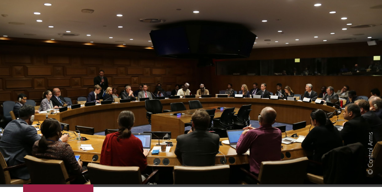
NEW YORK 2017 Report from the Arms Trade Treaty Conference of States Parties 2017 and Prospects of the Conference of States Parties 2018.

In the third paragraph of the ATT preamble, the obligation to prevent 'diversion' is described as follows: "Underlining the need to prevent and eradicate the illicit trade in conventional arms and to prevent their diversion to the illicit market, or for unauthorized end use and end users, including in the commission of terrorist acts".28 This statement is not an agreed definition of 'diversion' as such, but it does give an indication of three fundamental elements that States considered should be included to address the issue of 'diversion' when they negotiated the ATT text to its final adoption by the General Assembly in April 2013—in other words, to prevent: