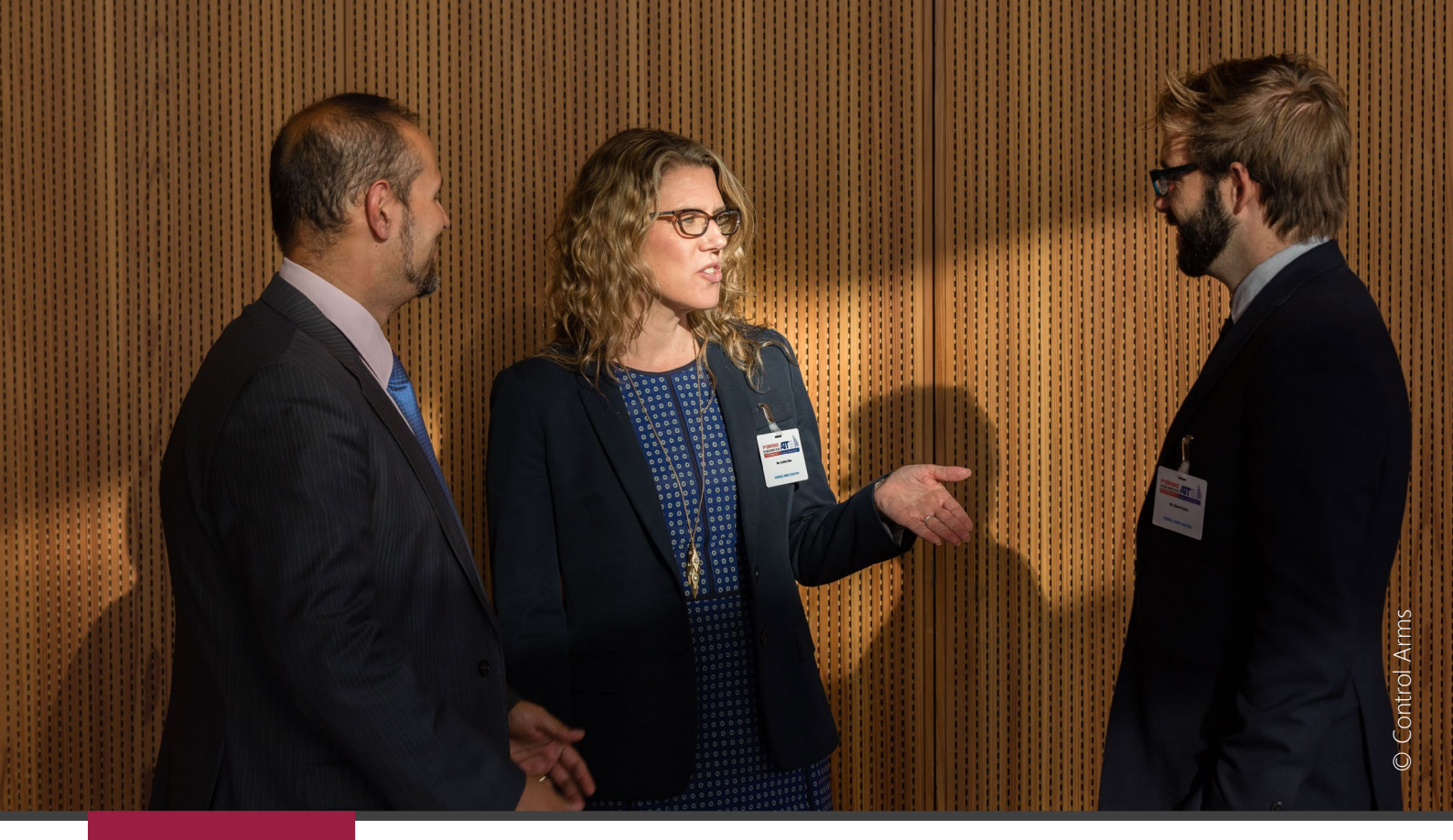
GENEVA 2017 Participants at the 3<sup>rd</sup> Conference of States Parties of the ATT, Geneva, 2017.

expanded sanctions to include direct and indirect trade with the Islamic State in Iraq and the Levant and recalled States' obligation to eliminate the supply of weapons to terrorist groups. In resolution 2370 (2017) the Security Council for the first time specifically named a wide range of arms and related materiel-including small arms, light weapons, larger military equipment such as unmanned aircraft systems and their components, as well as improvised components for explosive strengthen worldwide devices—to measures against those groups involved in terrorist acts.