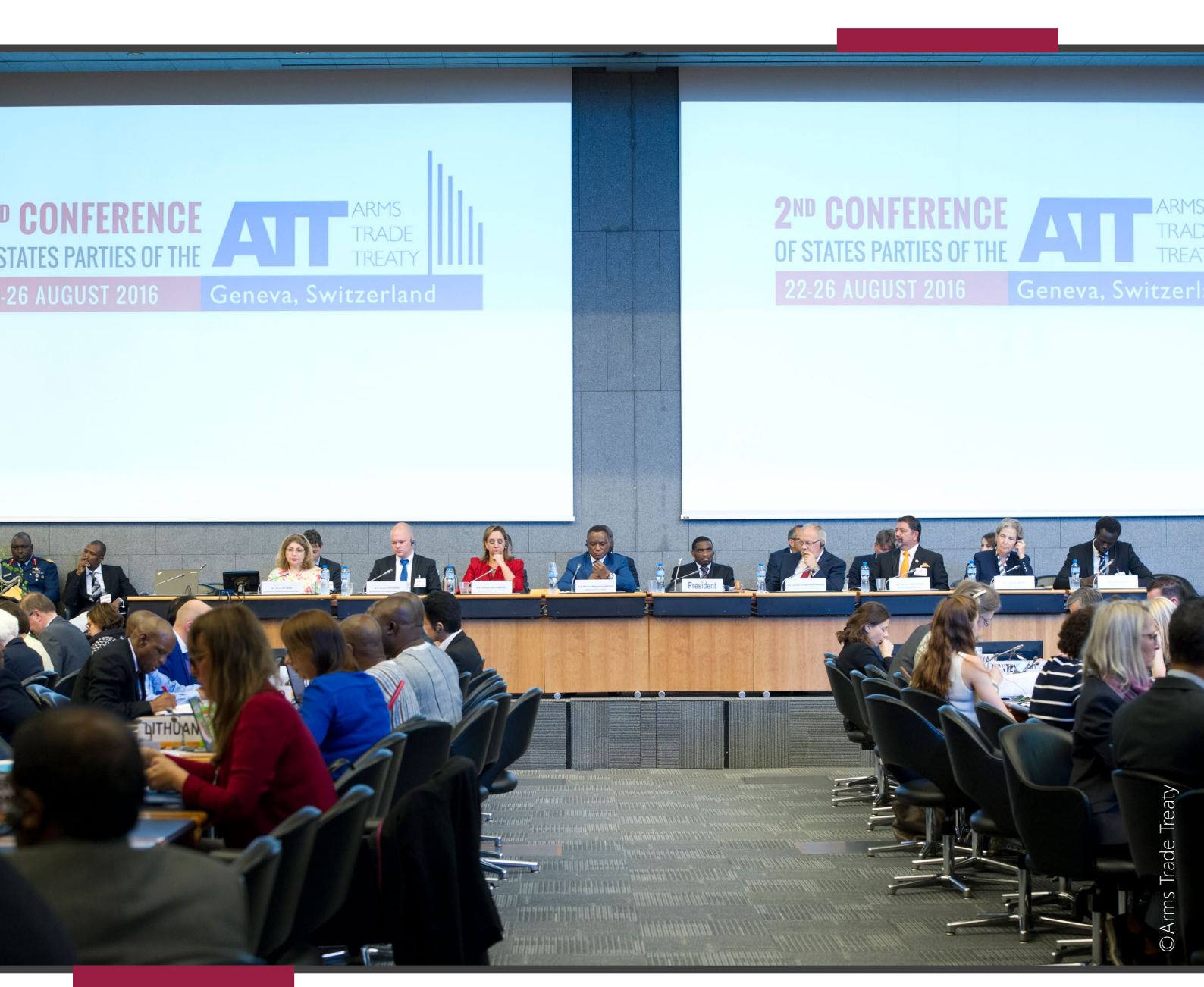
GENEVA 2016 2nd Conference of States Parties of the ATT, Geneva, 2016.