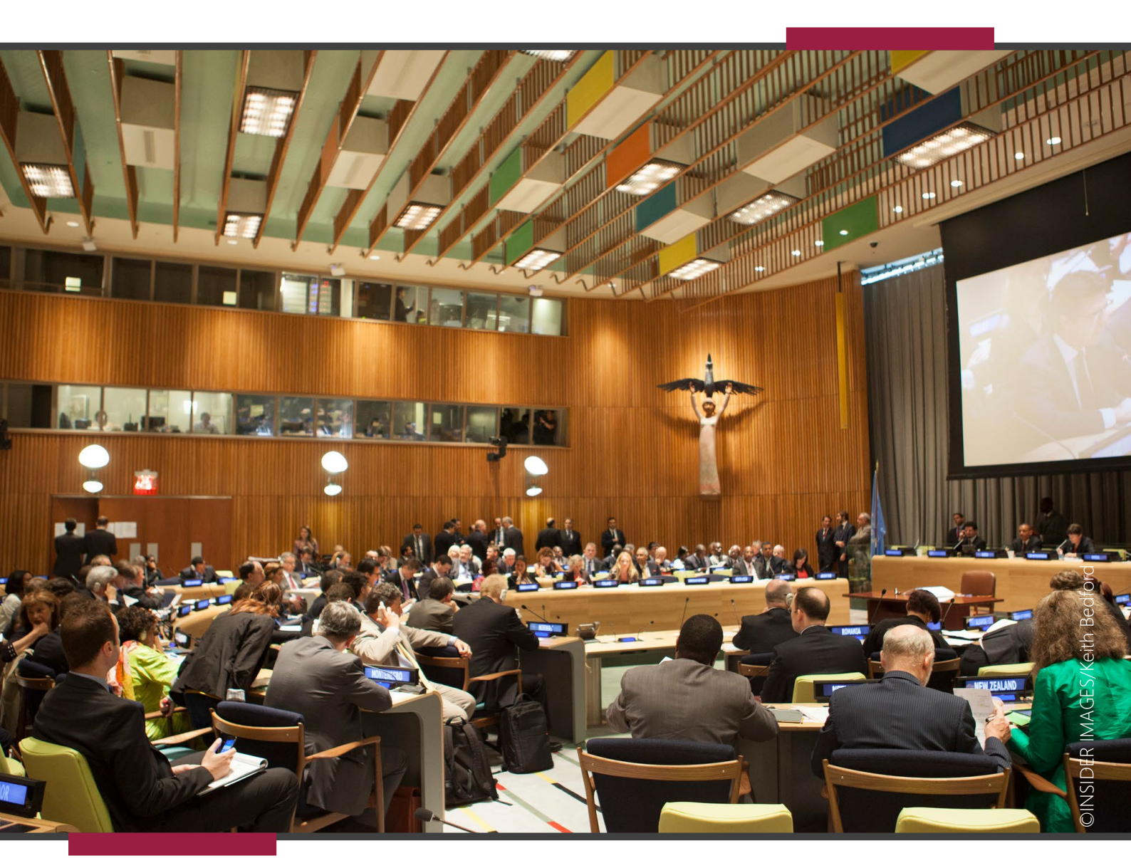
NEW YORK 2013

Foreign Ministers and Ambassadors sign the Arms Trade Treaty at the United Nations headquarters in New York, USA.