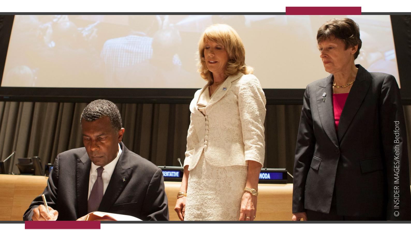
NEW YORK 2013

Foreign Ministers and Ambassadors sign the Arms Trade Treaty at United Nations headquarters in New York, USA.