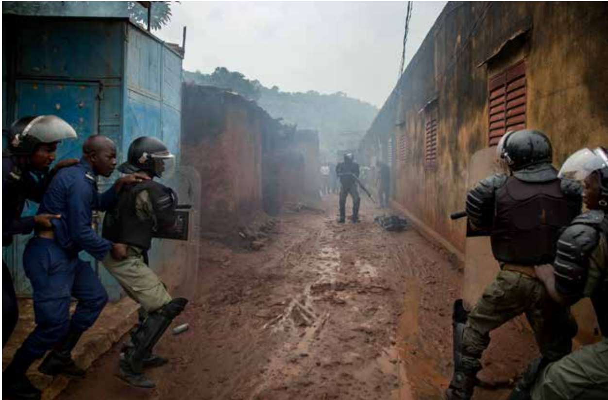
Members of Mali's National Guard and Police attend a crowd control training conducted by UNPOL Training Team of MINUSMA in Bamako. For the first time in Mali, 86 members of National Guard were trained by UNPOL Officers. The training was attended by 46 Police members as well.

In 2016, the Security Council altered the MINUSCA mandate to group stabilization together with reconciliation. The mission was mandated to provide “support for the reconciliation and stabilization political processes, the extension of State authority and the preservation of territorial integrity.” 25 Under this heading, the mission was mandated to support efforts to address the root causes of the conflict, support efforts to address marginalization, and support the training and redeployment of the state security forces. 26