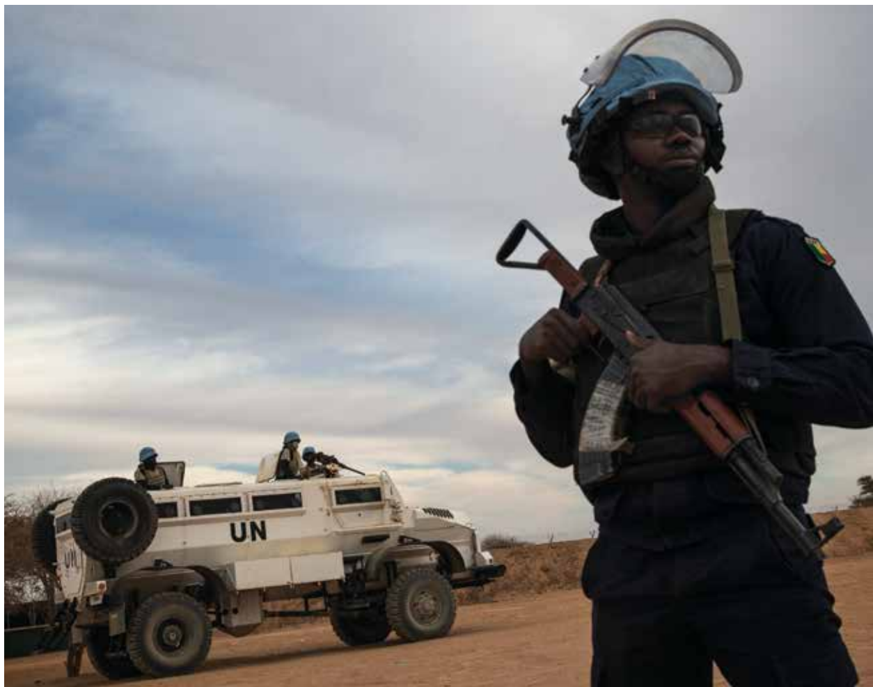
Members of the MINUSMA Formed Police Unit (FPU) from Benin patrol the airport as the delegation from Bamako leaves Kidal in the aftermath of the terroristic attack during which six peacekeepers from Guinea were killed and many other injured in Kidal, in the northern part of Mali.

Because stabilization missions are viewed by some as inherently more robust, member states may also be more hesitant to offer troops to serve in stabilization missions. If stabilization missions are perceived as operating in areas where there is no peace to keep, troop-contributing countries may not want their troops to serve in environments they perceive as riskier, and some member states that view peace enforcement as out of bounds may not wish to participate for ideological or principled reasons. When member states do acquiesce to send troops to a stabilization mission, they may specify greater caveats on where and under what conditions their troops must be stationed in response to the perceived increased risk. Conversely, countries sending their troops to non-stabilization missions may wrongly think that their troops are not required to use force as robustly, with potentially dangerous consequences for civilians in need of robust physical protection.