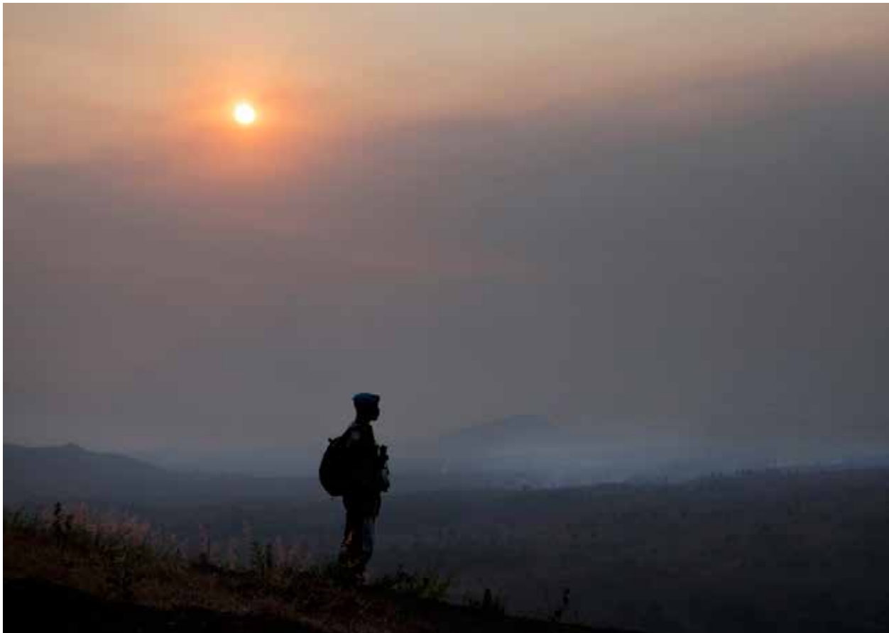
A MILOBS watches the sunset on the battlefield during an observation mission on Munigi Hill as FARDC conduct an attack on M23 rebel positions in Kanyaruchinya near Goma.

This report proposes a clear definition of stabilization that describes a specific strategic objective: supporting the transfer of territorial control from spoilers to legitimate authorities. It ensures that this definition is as consistent as possible – given the diversity of ways in which the term has been used – with the mandates and practices of the four stabilization missions that have so far been authorized. It explains how peacekeeping missions can, by this definition, implement their stabilization mandates without falling afoul of the core principles of peacekeeping. And it offers suggestions for how stabilization can be incorporated into a political strategy and be implemented alongside the protection of civilians. The UN Secretariat should adopt this definition to bring clarity to a term that has been left unexplained for too long.