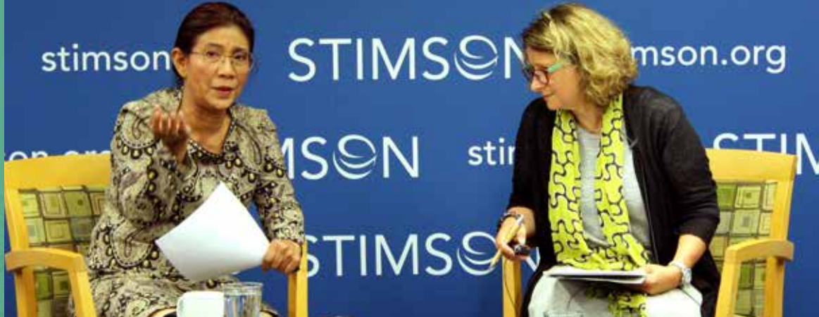
Minister Susi Pudjiastuti and Sally Yozell discuss IUU fishing in Indonesia at a Stimson Center event in May 2017.