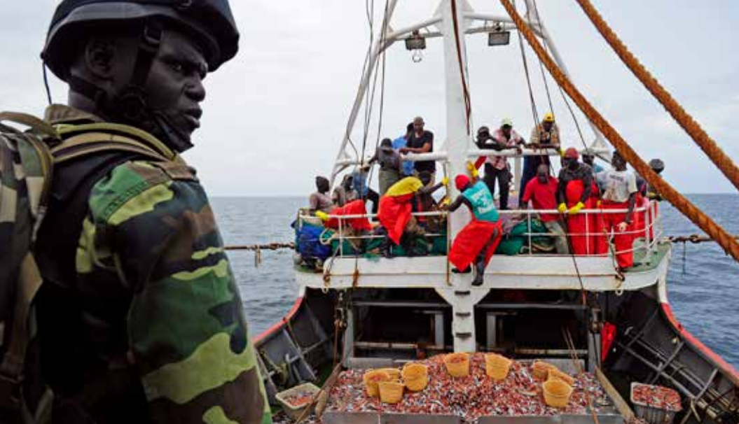
A Senegalese navy officer directs a joint boarding team of U.S. Coast Guardsmen and Senegalese sailors while conducting a routine inspection of a fishing vessel operating in Senegal's EEZ.