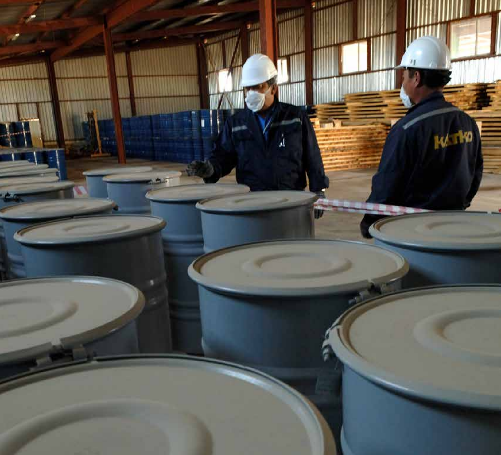
Drums of uranium ore concentrates