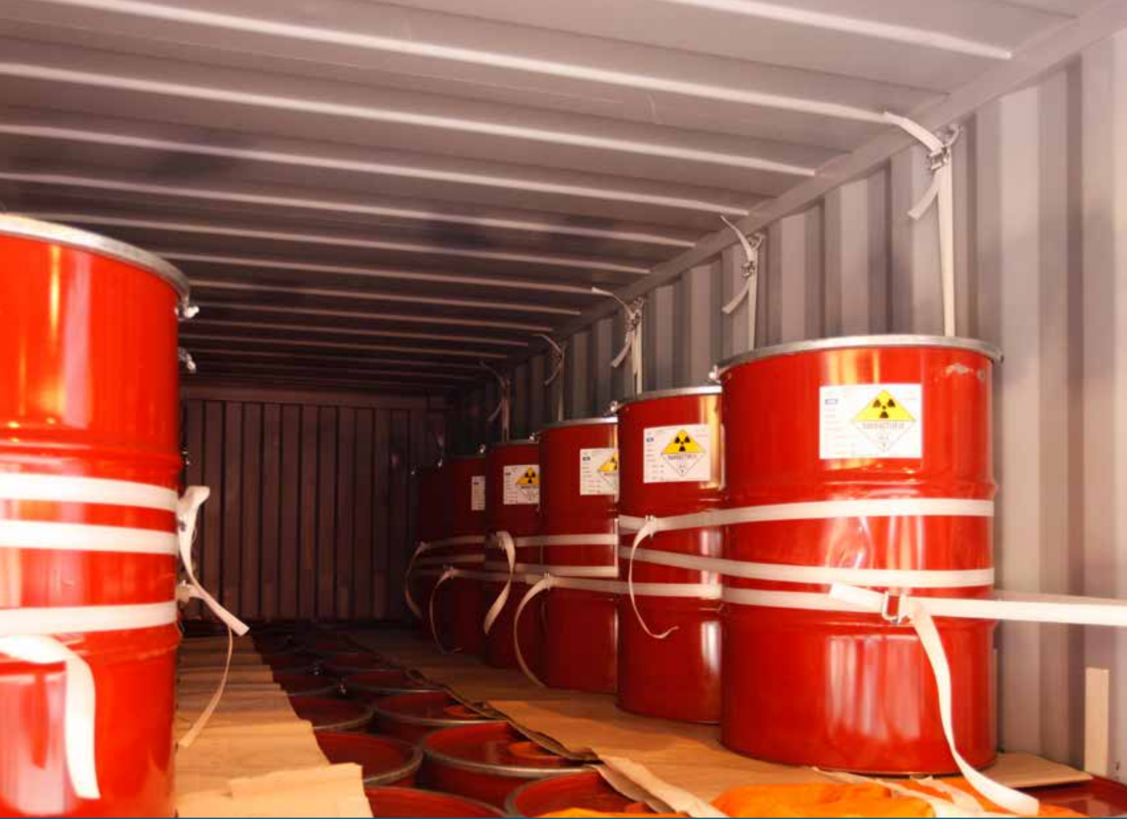
UOC Drum Packing

Negotiations in Argentina ended with a different starting point for the conversion facility at Cordoba. Although uranyl nitrate is technically difficult to measure in liquid form, Argentina's position was to apply PP18 exactly at the point of uranyl nitrate in process (not before, as in Canada). After five years of negotiations, it was agreed that the starting point would begin with measuring the liquid store in a retention tank. The first IAEA inspection covered by PP18 took place at Cordoba in January 2013. 52 Argentina is currently constructing another \text{UO}_2 conversion plant in Formosa with a design capacity of 230 MTU/yr. It uses the same process as the Cordoba plant, and a similar starting point is anticipated. Operations at Formosa are planned to begin in 2020.