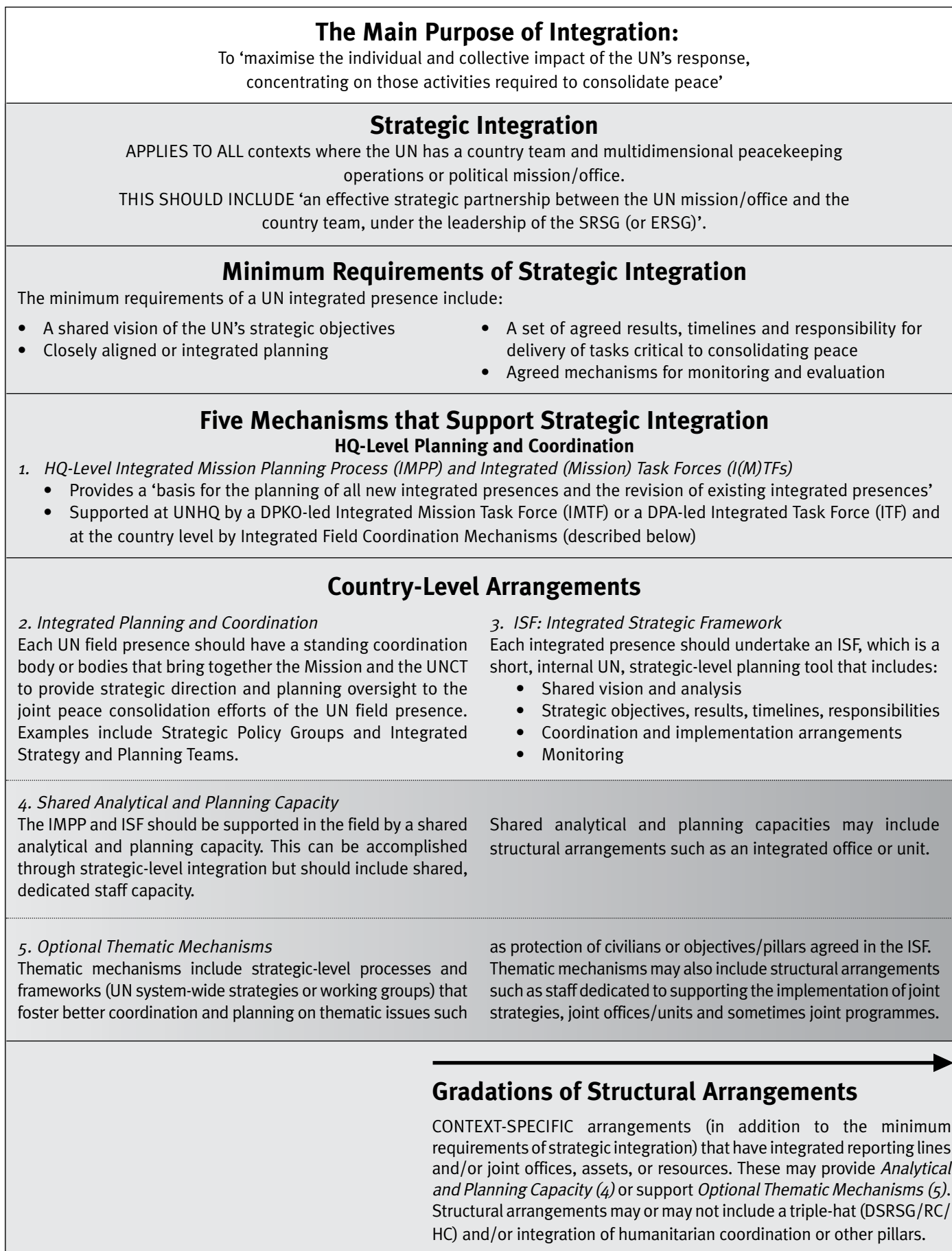
Figure 1: Common Characteristics/Capacities of Structural Integration

This diagram reflects the following policies: Decisions of the Secretary-General No. 24/2008 and existing IMPP Guidelines endorsed by the Secretary-General as of 2010 as well as practices observed in the cases reviewed for this study.