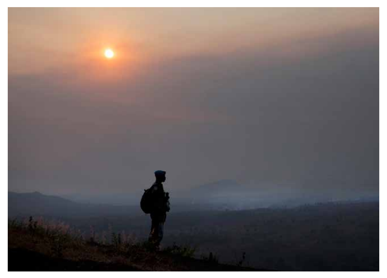
A \ MILOBS \ watches the sunset on the battlefield during an observation \ mission on \ Munigi \ Hill \ as \ FARDC \ conduct \ an \ attack \ on \ M23 \ rebel \ positions \ in \ Kanyaruchinya \ near \ Goma.

This report proposes a clear definition of stabilization that describes a specific strategic objective: supporting the transfer of territorial control from spoilers to legitimate authorities. It ensures that this definition is as consistent as possible – given the diversity of ways in which the term has been used – with the mandates and practices of the four stabilization missions that have so far been authorized. It explains how peace-keeping missions can, by this definition, implement their stabilization mandates without falling afoul of the core principles of peacekeeping. And it offers suggestions for how stabilization can be incorporated into a political strategy and be implemented alongside the protection of civilians. The UN Secretariat should adopt this definition to bring clarity to a term that has been left unexplained for too long.