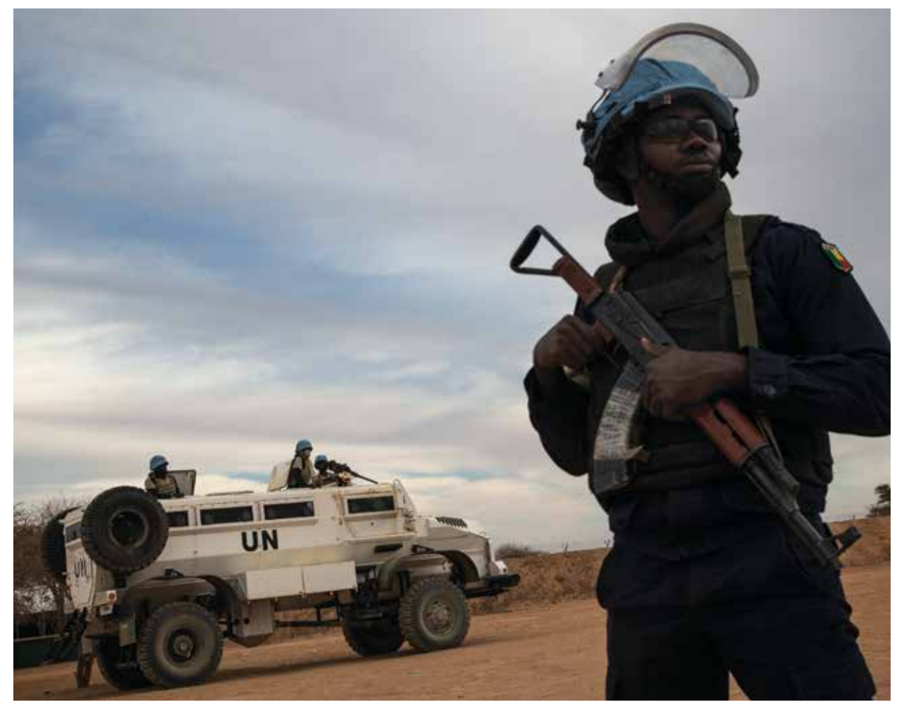
Members of the MINUSMA Formed Police Unit (FPU) from Benin patrol the airpot as the delegation from Bamako leaves Kidal in the aftermath of the terroristic attack during which six peacekeepers from Guinea were killed and many other injured in Kidal, in the northern part of Mali.

Because stabilization missions are viewed by some as inherently more robust, member states may also be more hesitant to offer troops to serve in stabilization missions. If stabilization missions are perceived as operating in areas where there is no peace to keep, troop-contributing countries may not want their troops to serve in environments they perceive as riskier, and some member states that view peace enforcement as out of bounds may not wish to participate for ideological or principled reasons. When member states do acquiesce to send troops to a stabilization mission, they may specify greater caveats on where and under what conditions their troops must be stationed in response to the perceived increased risk. Conversely, countries sending their troops to non-stabilization missions may wrongly think that their troops are not required to use force as robustly, with potentially dangerous consequences for civilians in need of robust physical protection.