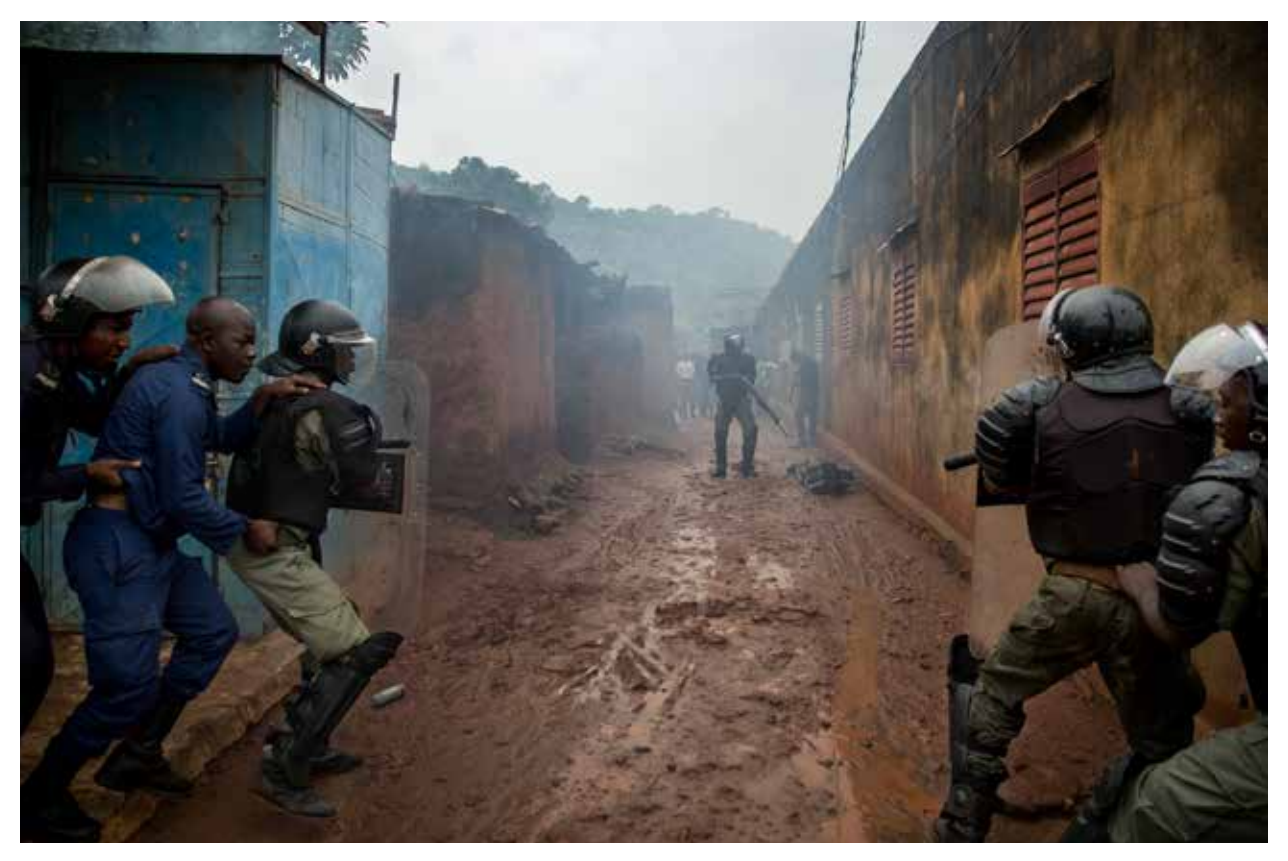
Members of Mali's \ National \ Guard \ and \ Police \ attend \ a \ crowd \ control \ training \ conducted \ by \ UNPOL \ Training \ Team \ of \ MINUSMA \ in \ Bamako. For the \ first \ time \ in \ Mali, 86 \ members \ of \ National \ Guard \ were \ trained \ by \ UNPOL \ Officers. The \ training \ was \ attended \ by \ 46 \ Police \ members \ as \ well. \ Photo \ by \ UNPoto/Marco \ Dormino

In 2016, the Security Council altered the MINUSCA mandate to group stabilization together with reconciliation. The mission was mandated to provide "support for the reconciliation and stabilization political processes, the extension of State authority and the preservation of territorial integrity."<sup>25</sup> Under this heading, the mission was mandated to support efforts to address the root causes of the conflict, support efforts to address marginalization, and support the training and redeployment of the state security forces.<sup>26</sup>